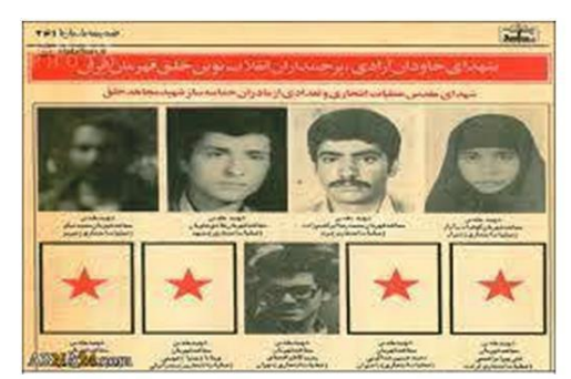
MEK's Suicide Bombers Among them 13yrs old girl (top right) MEK Publication «Mojahed» Isse261

The world is shocked by unbelievable and devastating reports of Saturday 5 March 2016 that, <u>The Islamic State is recruiting and indoctrinating children using the</u> same methods as the Nazi regime, with the goal of creating an even more lethal second generation of extremists, states a report by the London-based anti-extremism think-tank Qulliam.